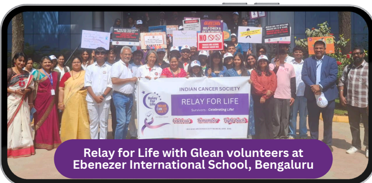
Relay for Life with Glean volunteers at Ebenezer International School, Bengaluru