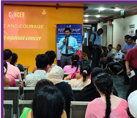
Cancer survivors & caregiver programme at AJ Hospital, Mangaluru