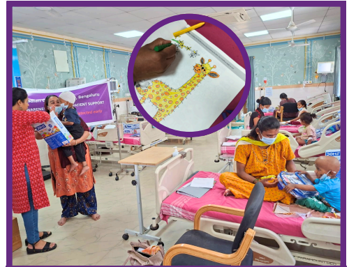
Art therapy sessions brought comfort and creative expression to pediatric patients across Bengaluru.