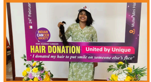
Hair Donation camp at Father Muller Hospital, Mangaluru