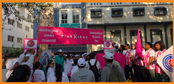
Women's Day Pinkathon with LTTs volunteers, Bengaluru