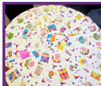
LTTs, Tektronix and Oracle volunteers created cards & bookmarks to inspire hope among cancer patients